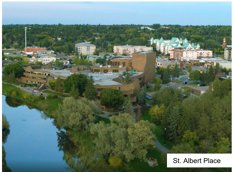
St. Albert Place

An annual review of the plan will occur, with progress reported quarterly through the Corporate Quarterly Reports.