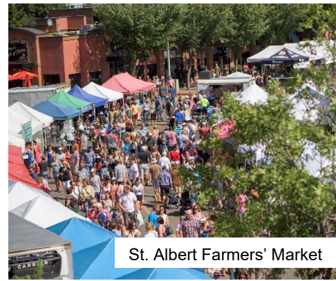
St. Albert Farmers' Market