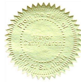
Cathy Heron Mayor, City of St. Albert The Botanical Arts City