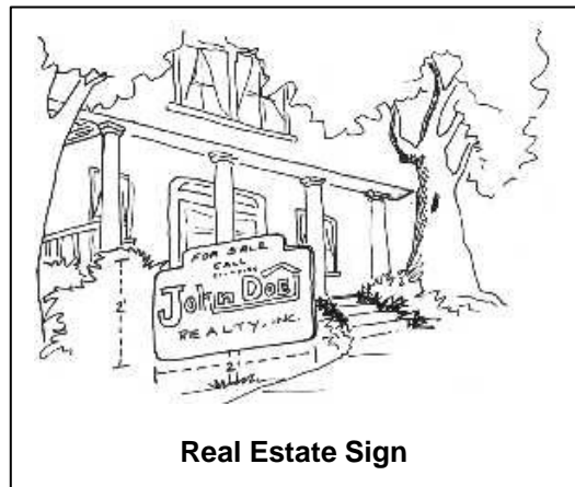
Real Estate Sign